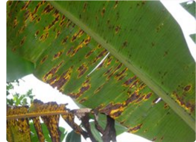
Photo 3. Diamond leaf spots, Cordana musae , centred on those of banana black cross, Phyllachora musicola .