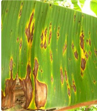
Photo 1. Large diamond-shaped spots of Cordana musae , parallel to the leaf veins.