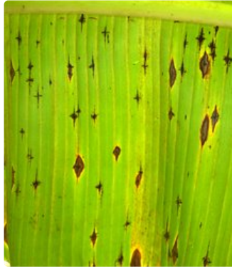
Photo 2. Association of diamond leaf spot, Cordana musae , with leaf spots of banana black cross, Phyllachora musicola . The suggestion is that Cordana is a weak pathogen needing a wound to infect.