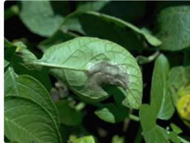
Photo 2. Underside of potato leaf with spot caused by late blight, Phytophthora infestans . Note spores form on the margin of the spot.