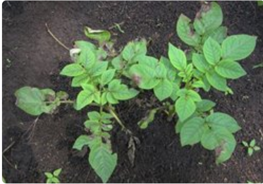
Photo 1. Symptoms of late blight on potato, Phytophthora infestans .