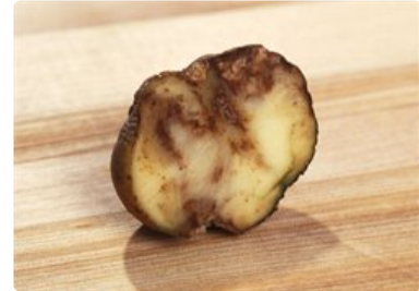
Photo 3. Brownish-reddish rots in a potato tuber caused by late blight, Phytophthora infestans .