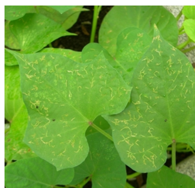
Photo 2. Irregular feeding marks on the upper surface of sweetpotato made by the sweetpotato flea beetle, Chaetocnema confinis .