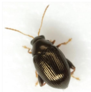
Photo 1. Adult sweetpotato flea beetle, Chaetocnema confinis .

No pesticides are recommended; the damage caused by the beetle is unlikely to affect storage root yields.