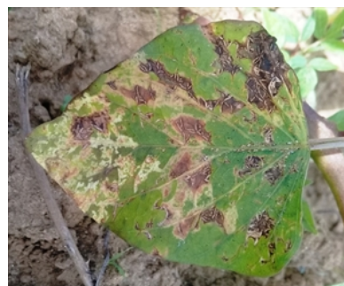
Photo 4. Rots developing from feeding marks of sweetpotato flea beetle, Chaetocnema confinis , on sweetpotato.